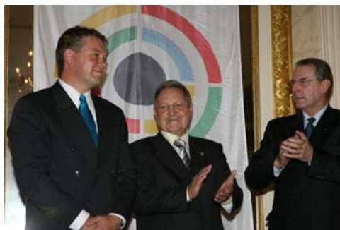
Russell Mark, ISSF and IOC Presidents

The anniversary was also an opportunity to celebrate some the legends of our sport, the athletes who have contributed to the history of the ISSF.